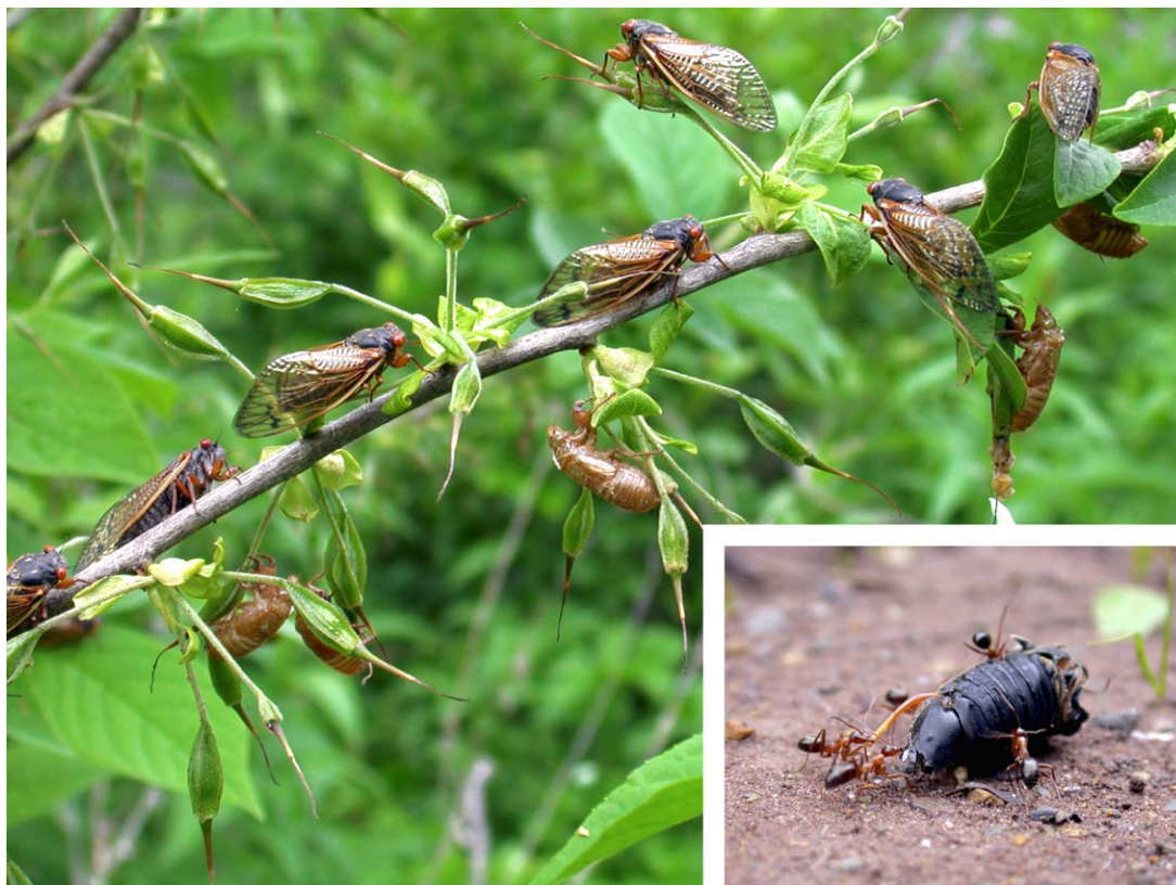
PLATE 1. Images of periodical cicadas in eastern North American forests. The larger photo shows periodical cicadas basking in the morning sun after their emergence at the University of Virginia Blandy Experimental Farm, Virginia, USA. The smaller inset photo shows Formica sp. ants consuming a dead periodical cicada carcass in Green Ridge State Forest, Maryland, USA.

increases were observed after 28 days (Yang 2004). Soil \text{NH}_4^+ and \text{NO}_3^- concentrations increased substantially during the first 30 days after cicada deposition, and \text{NO}_3^- concentrations remained elevated during days 31–100. The behavioral aggregation responses of some detritivorous arthropods were relatively quick, occurring within seven days after cicada deposition, although the indirect effects of mobile consumers may diffuse over a larger spatial scale (Yang 2006). American bellflower ( Campanulastrum americanum ) plants receiving pulses of cicada detritus exhibited higher foliar N content and greater seed size and mass at the end of the growing season 75 days later (Yang 2004; Fig. 2).