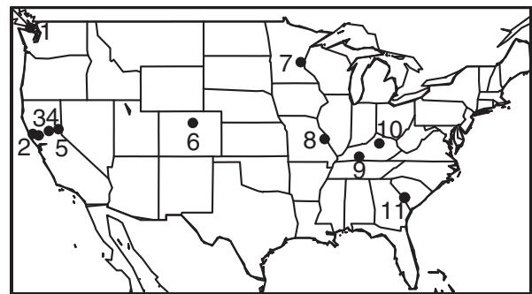
Figure 1 Seed ( Avena sativa )-removal trials conducted at 11 Nutrient Network (a large-scale experiment examining nutrient and consumer effects on worldwide grasslands) sites across North America. Each of the 11 sites contained between two and four replicate blocks, with one plot (four seed-removal depots) within each block. For additional details, see Appendix S1. The sites were: (1) Cowichan, British Columbia, Canada; (2) Hopland Reserve, California, USA; (3) McLaughlin Reserve, California, USA; (4) Sierra Foothills Reserve, California, USA; (5) Sagehen Reserve, California, USA; (6) Boulder, Colorado, USA; (7) Cedar Creek, Minnesota, USA; (8) Tyson, Missouri, USA; (9) Hall's Prairie, Kentucky, USA; (10) Spindletop, Kentucky, USA; (11) Savannah River Site, South Carolina, USA.

Our study was conducted in 2009 at 11 grassland sites across North America (Fig. 1) that were part of the Nutrient